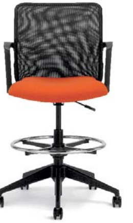
Ten stool with mesh back. >

With Ten mesh smart new look and a choice of stool, side or task version and a variety of fabric seats to choose, Ten mesh will blend right in with any office de'cor. Its wall saver frame is available in both silver and black. When it comes to strength, durability and sustainability, Ten's 13 gauge 1" diameter steel frame with Highmark's lifetime warranty will knock any competitor out of the ball park and it's rated up to 300 lbs. Mix and match both Ten and Ten mesh to any office environment to make that design touch at an eye-catching price point.