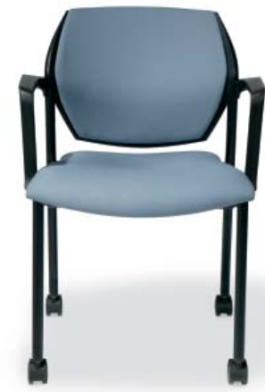
< Fully upholstered Ten with casters. >

Design, Comfort and Flexibility. The Ten series chairs are available in six thermoplastic colors or with an upholstered seat & back for added comfort. Ten is also available in a black or silver wall saver frame with a basic task or swivel tilt control and comes with or without arms.