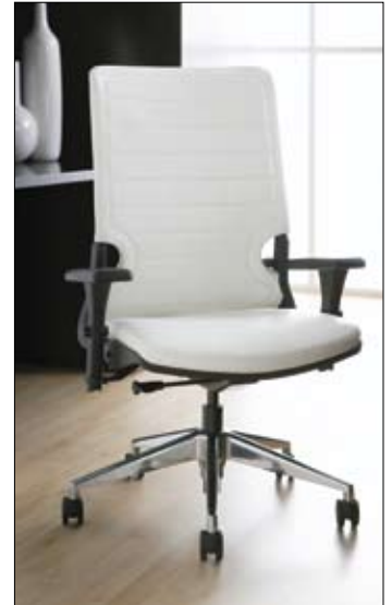
InSync is now available in leather and fabric backs and a new grey finish option (below right).

Since launching InSync and our 'seating made simple' brand promise last year, Highmark has defied industry trends by growing in sales and representation.